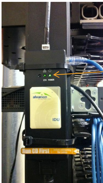
The IDU unit for the public wireless was malfunctioning with the power indicator light turned amber color until it was powercycled.

The Public wireless access was down due to the fault of network equipment. The equipment was powercycled to fix the issue.