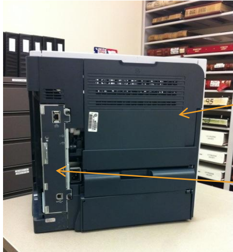
HP Laserjet M601

One of the network printers (HP Laserjet M601) at the Circuit Clerk Office was not functioning due to a bad Formatter. After working online with HP tech support on and off for 13 hours, a replacement formatter was shipped and installed. The problem was not solved, the printer and the part were returned to the manufacturer and a replacement printer was shipped to replace the faulty printer.