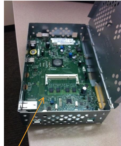
Formatter Replacement Part

One of the PCs in the State's Attorney's office was replaced due to hardware problems.